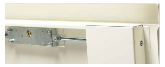
◆ Top internal shute bolts for night locking - self-closing hinge