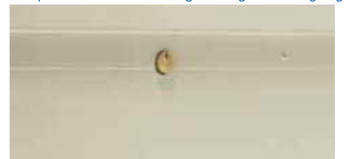
▲ External key lock for shute bolt

The Secure Cabinets are constructed from 2mm sheet steel with a reinforced door as standard. The cabinet door includes self-closing hinges (Reversable left or right opening) with push button lock and key override. Top & bottom shute bolts for out of hours multi-point locking as standard. All cabinets are powder coated for durability and fitted internally with Keytracker support channels. Optional mirror-finish stainless door front available.