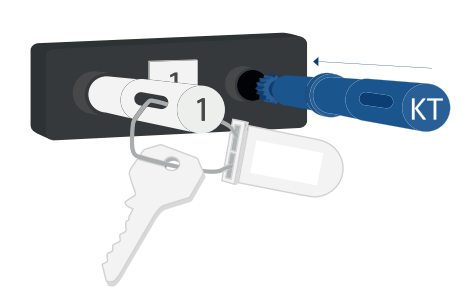
1. Insert your personal initialled & colour coded access peg