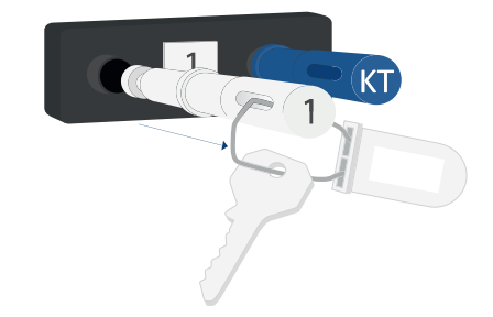
3. Remove the retention peg with keys attached