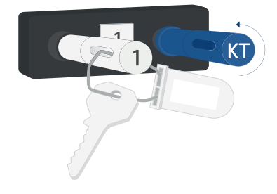
2. Twist anti-clockwise to release the desired key bunch