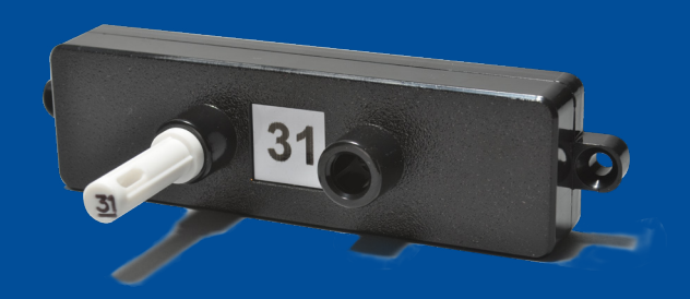
T/1 - For keeping track of a single set of keys, tools or equipment.