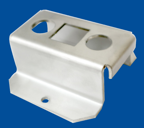
T/1c - For additional durability when keeping track of heavy or bulky equipment such as ladders or sack trucks.